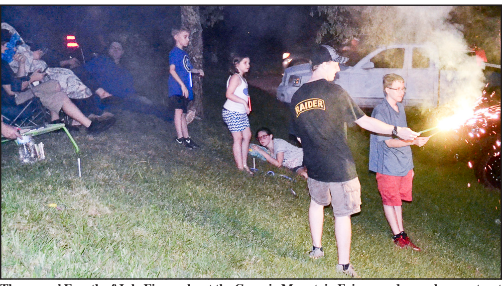
The annual Fourth of July Fireworks at the Georgia Mountain Fairgrounds are always a treat for families, giving them a terrific way to celebrate America together as Americans.

Down at the Fairgrounds music courtesy of the band ballfields, the Towns County Vintage Vixens, a well-known Recreation Department will be and trained them, got them cer- favorite locally that will be See Happy Birthday USA, Page 8A