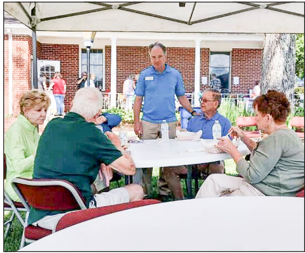
Sharp Memorial held an Open House for the church on June 13 after it had been closed for six months for renovations and repairs following major water damage.