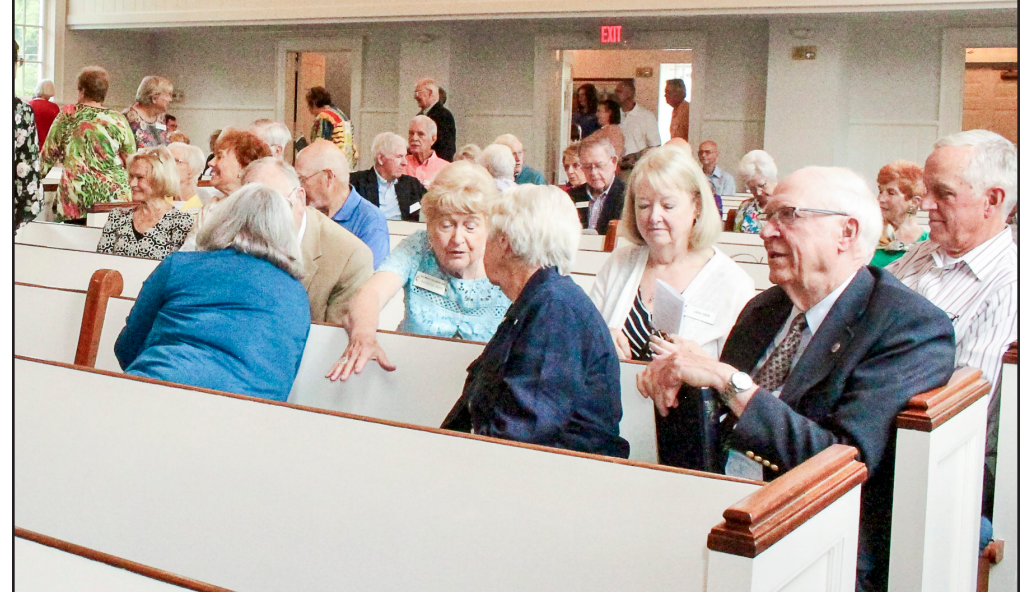
Members of Sharp Memorial UMC were happy to return to their home sanctuary for services on Sunday, June 18.

All individuals are presumed innocent until proven