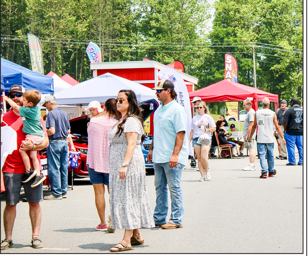
Several hundred guests turned out to support local first responders this month on Family Fun Day, which will return every year on the third Saturday in June.

informa-For more atoftownscounty.square.site/.